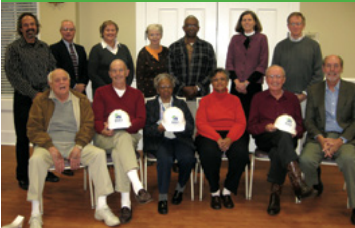
Representatives of the three St. Michaels Faith Build churches launch their partnership to construct a Habitat home.

The St. Michaels Faith Build is a partnership of Habitat Choptank and three St. Michaels churches—Christ Church-St. Michaels Parish, St. Luke’s United Methodist Church and Union United Methodist Church—to build another affordable Habitat home in St. Michaels. Habitat purchased the lot and provides overall construction supervision for the single family home on Brooks Lane. The churches are raising $75,000 to cover building costs and are supplying the weekly volunteers to build the house.